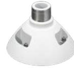
WV-QSR504M-W Mount Bracket