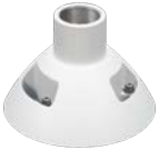
WV-QSR504F-W Mount Bracket