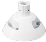
WV-QSR504-W Mount Bracket